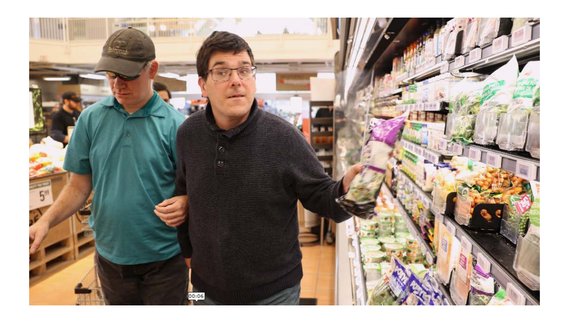
SUCCESS FACTOR - A HIGHLY VALUED COMMUNITY ORGANIZATION