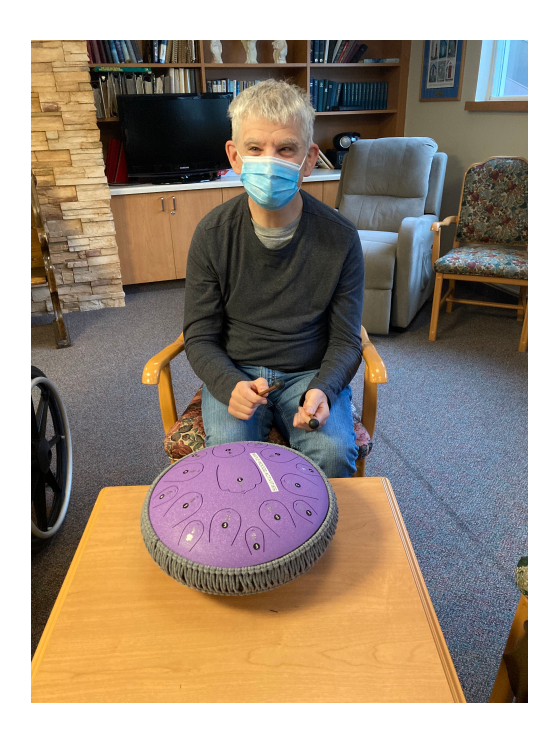
SUCCESS FACTOR - A HIGHLY VALUED COMMUNITY ORGANIZATION